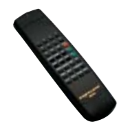
HS-101 Exposure System Remote Control (batteries included)