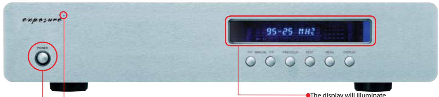
The Exposure 2010S2 FM Tuner : Front View

Ensure that the volume control knob or your amplifier is set to minimum.