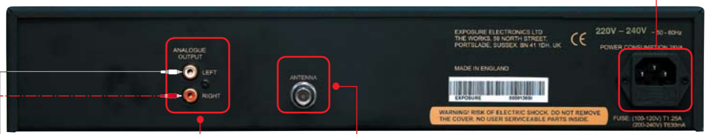
The Exposure 2010S2 FM Tuner : Back View